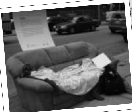
- What homelessness looks like for a woman who has to 'couch surf'.